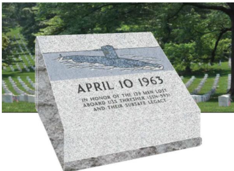
Proposed USS THRESHER Memorial

We thank those that have already supported this worthy cause. If you would like to find out how to support this effort, please visit: www.threshermemorial.org