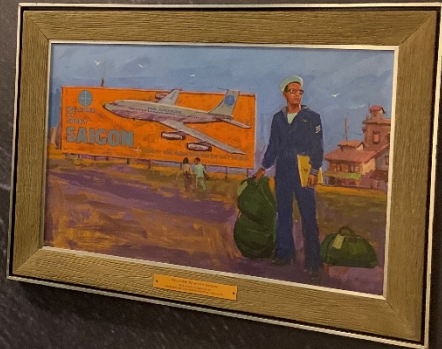
WELCOME TO SUNNY SAIGON © 1965 by [unreadable]

The service of 18 million Sailors (over 225,000 in Southeast Asia), empowered the United States military lasting effects on the Navy that are still with us today. The exhibit explores the missions and contributions of the Navy at sea, on land, and in the skies over Vietnam.