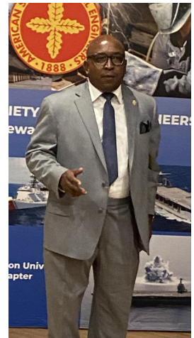
Mayor Shannon Glover